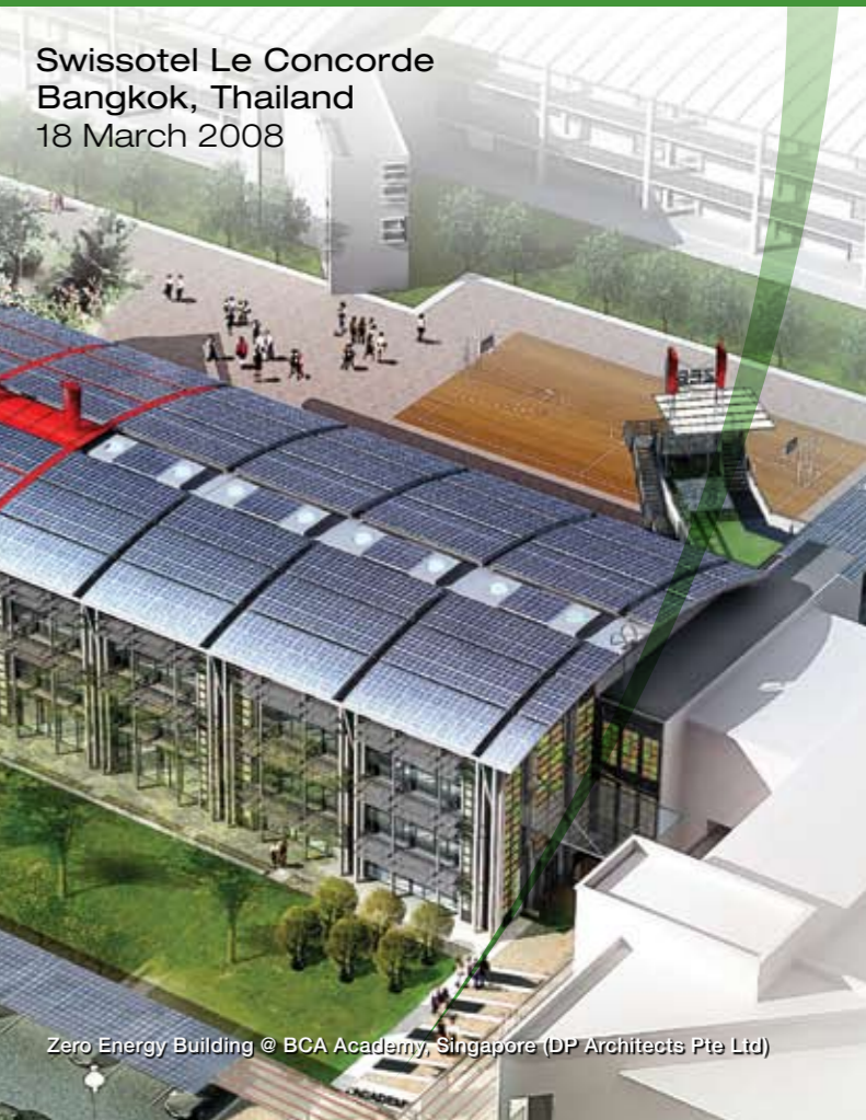
Zero Energy Building @ BCA Academy, Singapore (DP Architects Pte Ltd)

Swissotel Le Concorde Bangkok, Thailand 18 March 2008