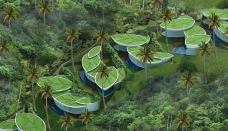
The Campuan, Indonesia (Edy Semara Architect International)